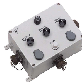
U3800 Master Station