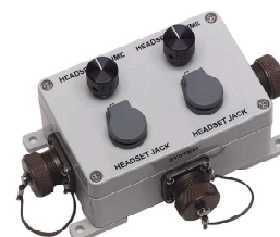
U3806 Dual Headset Station

360 Franklin Street, Box 15054, Worcester, MA 01615-0054 • Tel: 508-751-5800 • Fax: 508-753-5827